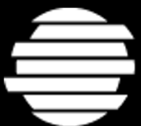
Image credits: "Beauty of amazonia", Sébastien Goldberg, Unsplash (Unsplash License)